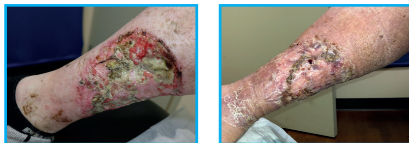
Male, 68yo patient. Wagner grade I basal cell cancer wound to right leg (10x10cm). Dual debridement followed by skin graft resulted in healing in 2 weeks. Images show before first debridement and healed wound 2 weeks post-treatment.