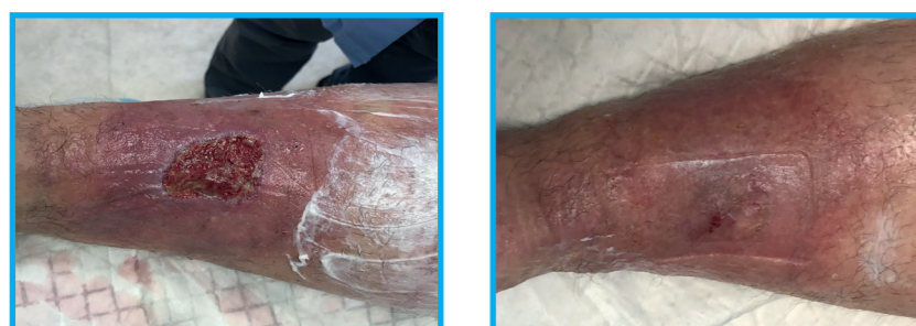
Male, 50yo patient. Wagner grade I VLU wound to right leg (8x8cm). Single debridement resulted in healing in 2 weeks. Images show before, and healed wound 2 weeks post-debridement.

Debridement is a critical step in wound bed preparation and healing. Multiple debridement tools exist with their associated advantages and disadvantages. We evaluate the clinical efficacy and ease-of-use of Micro Water Jet debridement (MWJ) on acute and chronic wounds in an office-based setting.