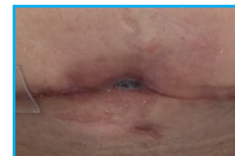
Female, 35yo patient. Wagner grade I abdominal wound (5x5cm). Single debridement resulted in healing in 6 weeks. Images show before and 4 weeks post-debridement.