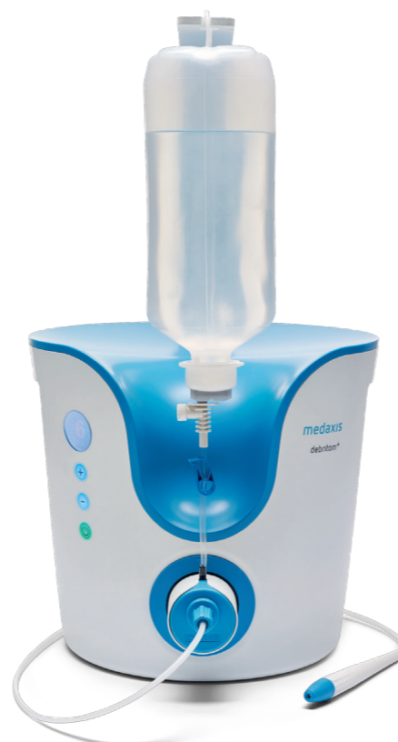
The debritor+ Micro Water Jet debridement technology by medaxis, www.medaxis.us

A series of 4 patients were evaluated with different wound types, location, and size who underwent micro-water-jet-debridement with saline. Average wound size was 35 sq. cm (Range: 25sq cm - 100 sq. cm). Clinical efficacy was noted by punctate bleeding and removal of desired tissue, with follow-up to document healing status. Ease-of-use was evaluated by set up time, surgeon's evaluation of the micro-water-jet's debridement characteristics, and patient comfort.